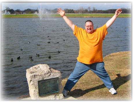
My pose in tribute to the "X"

where I could totally step outside myself and my problems and just really enjoy the friendships God has given me.